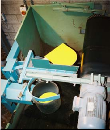
The yellow shovel takes samples from the flow and drops them in the black CEN Measuring Cylinder.

Do you also get the results of determining the moisture-contents of your growing media after they are already shipped to your customer?